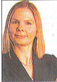
BY BECKI L. YOUNG

The DV Lottery Program is administered annually by the Department of State. Up to 50,000